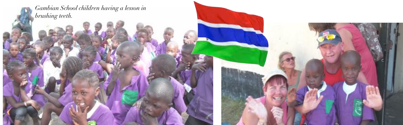
Gambian School children having a lesson in brushing teeth.