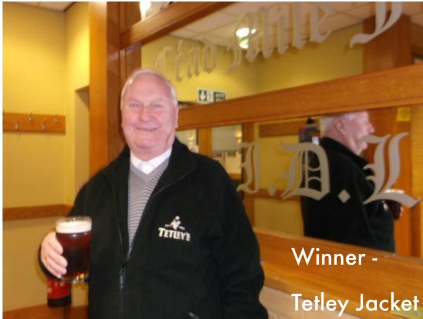
Winner - Tetley Jacket