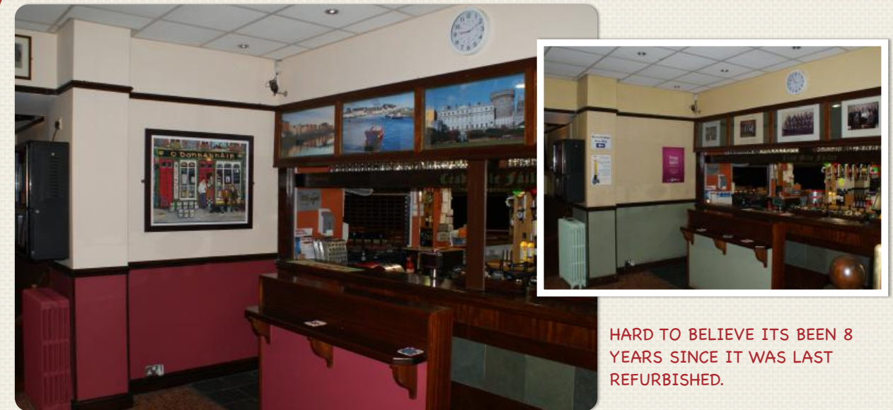
HARD TO BELIEVE ITS BEEN 8 YEARS SINCE IT WAS LAST REFURBISHED.