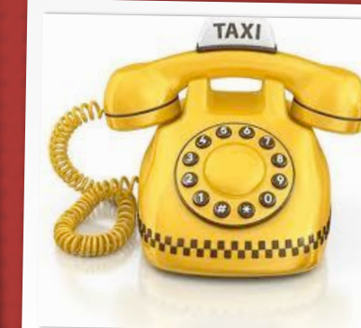
ANOTHER SERVICE TO OUR MEMBERS